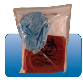
Deluxe Bloodborne Pathogen Kit #BP002 11" x 7.5" x 2.5" .50 lb