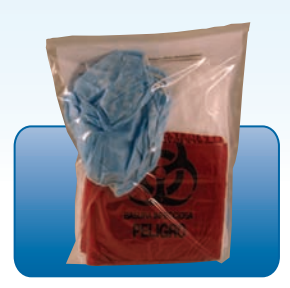
Deluxe Bloodborne Pathogen #BP002 11" x 7.5" x 2.5" .50 lb $17.79 MSRP