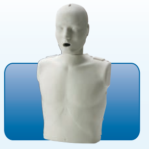
Prestan Manikin #PP-AM-100 Single manikin $114.75 MSRP #PP-AM-400 Four manikins $445.00 MSRP