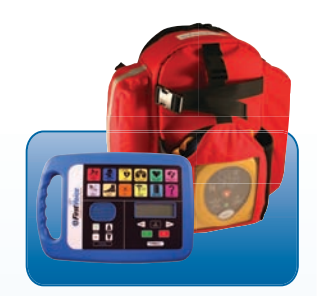
Backpack+AED #FV4199 17" x 13" x 13" 12 lbs