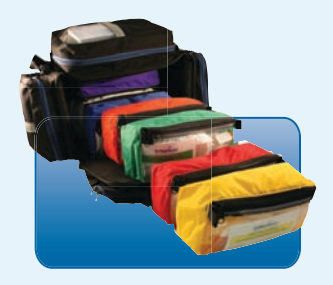
JumpBag #FV3105 17" x 13" x 13" 10 lbs $429.00 MSRP