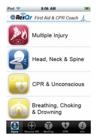
{injury category menu}

The free ResQr MedTag app is for quick access to your emergency information in unexpected situations or during urgent care clinic visits where you are unable to convey crucial information to emergency rescue or you just need quick reference to personal medical history or health insurance details. Simple and straightforward, keep this app current and accessible on your device. Store your: