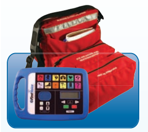
Basic Rollout #FV901 11" x 8.5" x 13" 8 lbs

Includes: Heartsine AED (for fv/mxx99 products), First Voice EID (for both fv/mxx01 and fv/mxx99 products), High quality durable case or bag system and prepackaged color-coded first aid/PPE supplies matching EID buttons, AmpuSave, BBP cleanup kit, EMS Handoff forms, First Aid Report forms, Inventory refill checklist, Maintenance checklist, Inspection tag, Tamperproof seal system, Responder handbook (140+ pages), User manuals and instruction cards, 7-year warranty on AED, and 3-year warranty on First Voice products. Also available without AED (product #FVxx01).