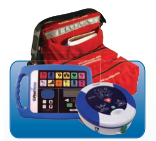
Basic Rollout+AED #FV999 11" x 8.5" x 13" 10.5 lbs

For the most effective and efficient emergency responder solution.