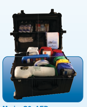
MarineO2+AED #M3699x 25" x 13" x 19" 42 lbs