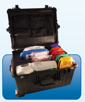
MarineO2 #M3601x 25" x 13" x 19" 38.7 lbs