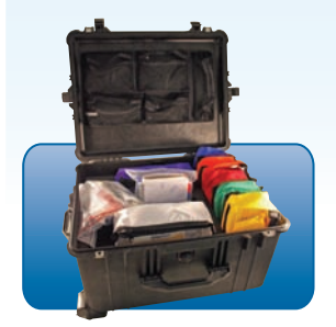
Marine #M3605 21" x 17" x 18" 30.3 lbs $873.00 MSRP with O2 #M3605X $1158.00 MSRP