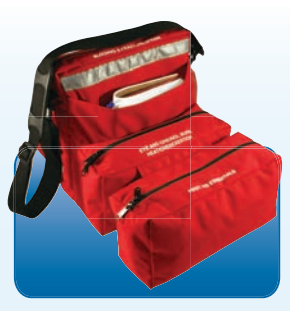
Basic Rollout #FV905 11" x 8.5" x 13" 6 lbs