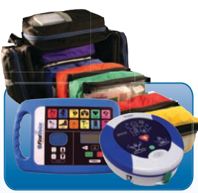
JumpBag+AED #FV3199 17" x 13" x 13" 12 lbs