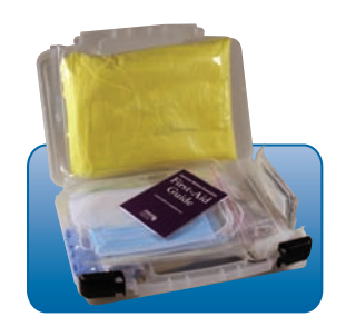
10" x 14" x 3.5" 2.74 lbs