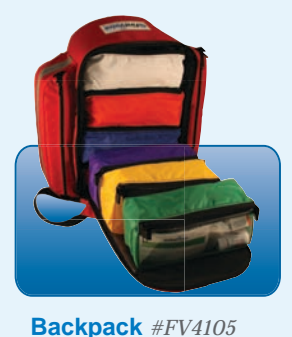
20" x 9" x 18" 7 lbs $429.00 MSRP