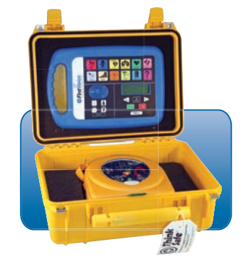
AED/EID Responder System #FV6001 16" x 13" x 6.87" 11.5 lbs

Approved by major training organizations.