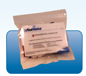
Basic Bloodborne Pathogen #BP001 7" x 5" x 2" .24 lb $9.99 MSRP