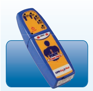
CPREZY CPR Assistance Device #HA800903 1 lb $159.95 MSRP