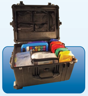
Marine #M3601 25" x 13" x 19" 32.38 lbs