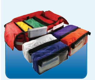
Duffel #FV2105 17" x 7" x 10" 10 lbs $339.00 MSRP