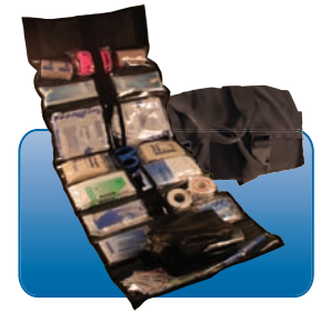
Law Enforcement Kit #FAP51 Rolled out: 34" x 13" Rolled up: 13" x 6" 3.88 lbs $99.00 MSRP