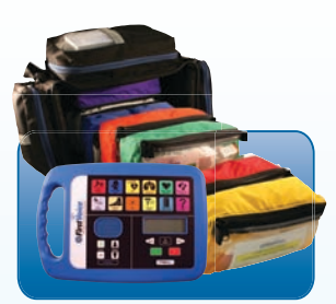
JumpBag #F3101 17" x 13" x 13" 12 lbs