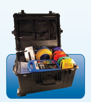
Marine+AED #M3699 25" x 13" x 19" 35.6 lbs