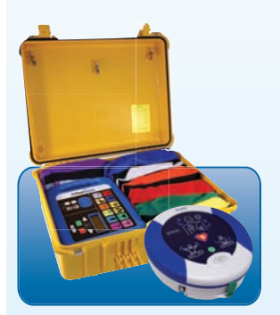
Rugged+AED #M3199 21" x 17" x 8" 19.5 lbs