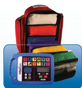
Backpack #FV4101 20" x 9" x 18" 9 lbs