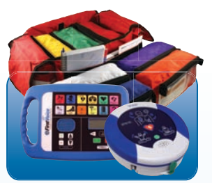
Duffel+AED #FV2199 17" x 7" x 10" 15.41 lbs