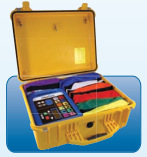
Rugged #M3101 21" x 17" x 8" 15 lbs