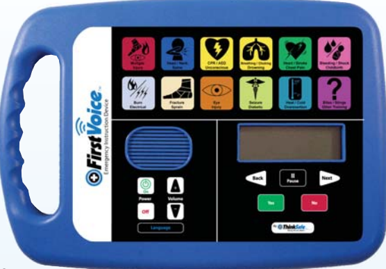
First Voice Emergency Instruction Device (#AVU5001x)

The EID is designed to effectively coach users on CPR & first aid from start to finish. In the event of an emergency, this simple, easy-to-use touch pad gives directions in English or Spanish on how to respond quickly and accurately. Be prepared in the event of a sudden emergency with minimal first aid training or experience.