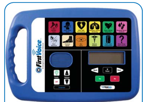
First Voice Emergency Instruction Device (AVU5001x)

Endorsed by the American Lifeguard Association Approved by major training organizations.