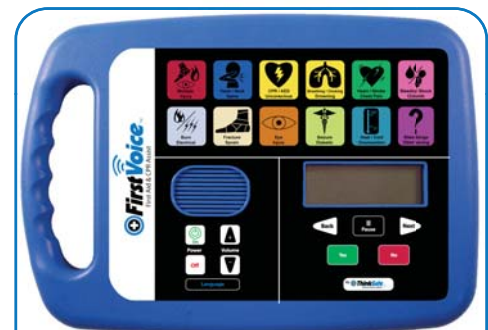
First Voice First Aid & CPR Assist (#CPRA01)