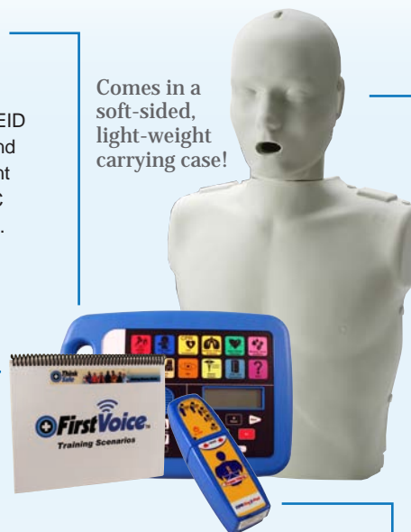
31" x 18" x 6" light-weight carrying case

The Training Scenarios Book (#TS001) can be used as needed for a quick anytime training refresher, bringing the instructor to you. Covers medical, injury, and environmental emergencies and ensures skills practice for CPR and a majority of workplace first aid incidences. Comes with quizzes and answer key for your workplace documentation records.