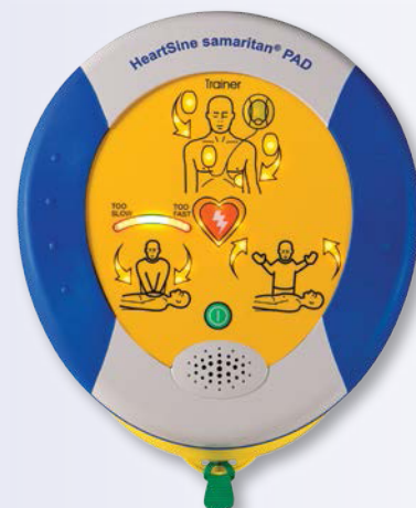
samaritan PAD 450P Trainer with CPR Rate Advisor Simulation (TRN-450-xx)