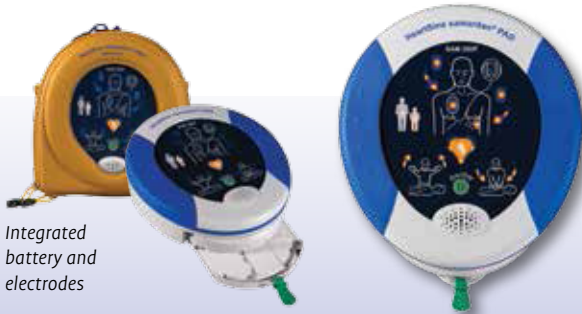
Integrated battery and electrodes