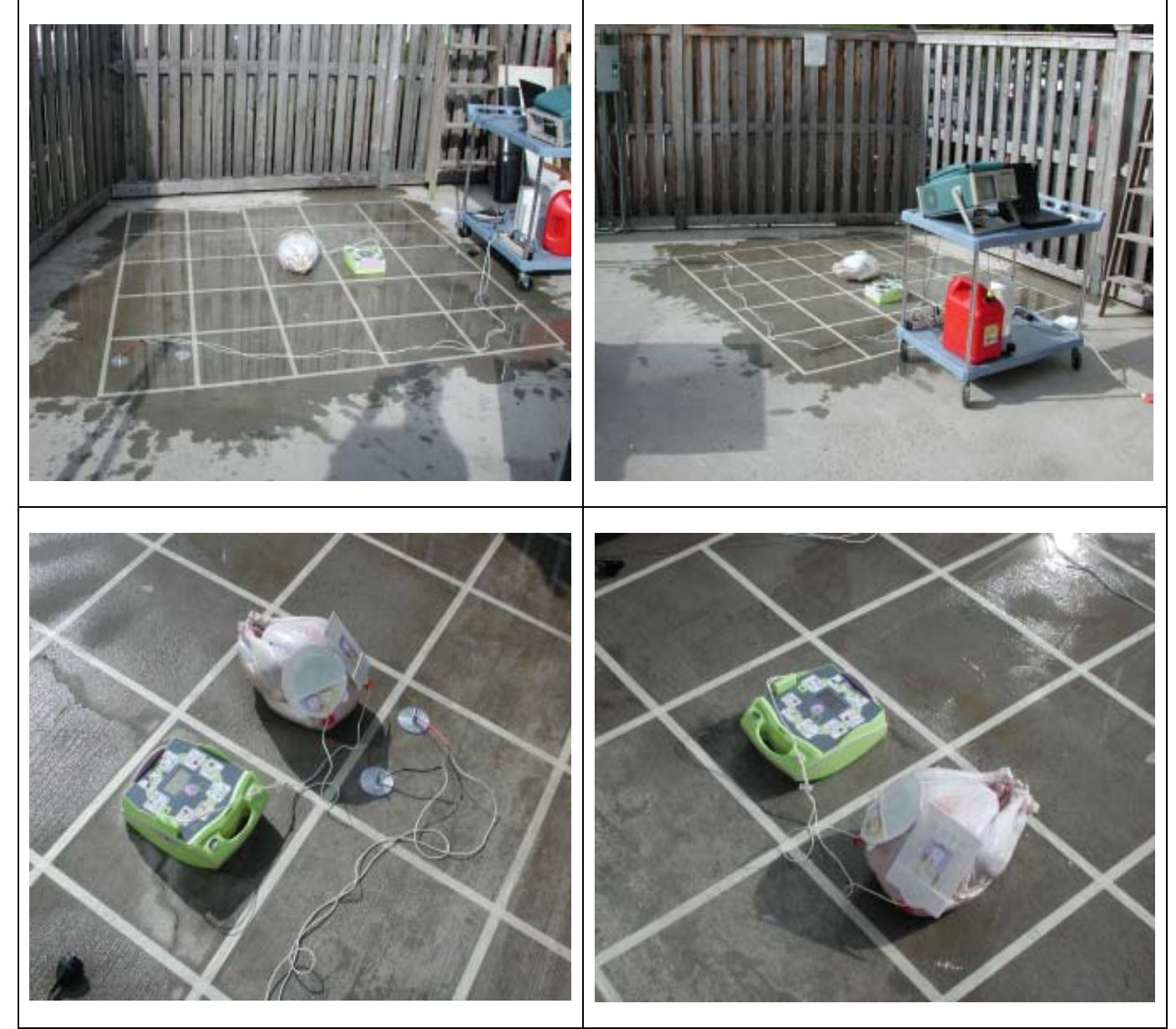
Figure 3. Test Area