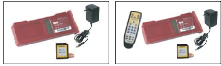
DCF-350T DCF-302T DCF-303T