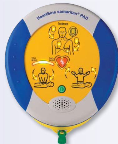
samaritan PAD 450P Trainer with CPR Rate Advisor Simulation (TRN-450-xx)