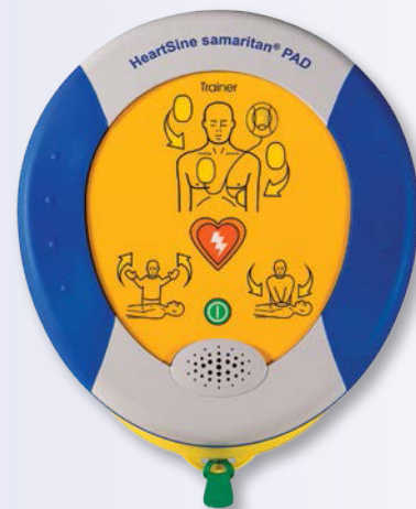
samaritan PAD 350P Trainer (TRN-350-xx)